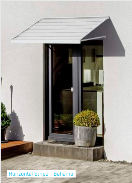
Horizontal Stripe - Bahama