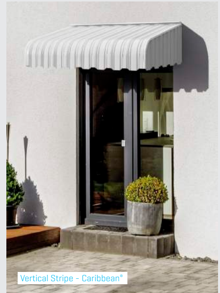
Vertical Stripe - Caribbean®