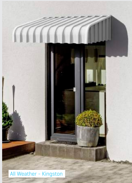
All Weather - Kingston