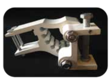
Extruded Arm Supports