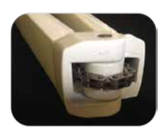
L Type Arms