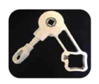
3:1 Gear Operation